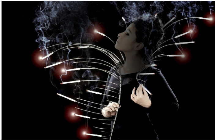
Figure 1. Artwork "Crossed Missedlead Civilization"

In this prototyping method, the author in general adapts several methods which are commonly practiced in approaching the different creation processes. These approaches are among others: exploration (brainstorming), which includes among others the exploration of concepts (observation and aesthetic experience in aesthetic structure), exploration through analysis of visual forms, and aesthetic exploration. These are followed by improvisation; the formation and extraction of various aspects of visual-artistic and aesthetic refinements utilizing technical and intuitive analytical skills. Then there are the stages of evaluation; evaluation of the various aspects in the relations of ideas, artistic execution and others which are related to depth of impression and expression; these are presented as a kind of emotional control and settlement which are synchronized with or comprehensively enveloping vibrating intellectual capacity of the creation process. Explorations among others are the exploration of conception (observation and aesthetic experience in aesthetic structure), visual form exploration and aesthetic exploration.